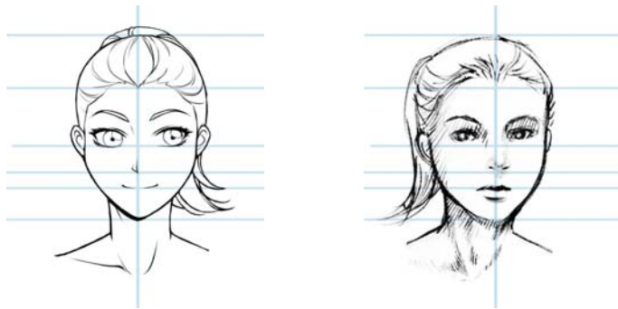
Figure 2: Comparison of proportions between female manga-style head (left) and realistic female human head (right).