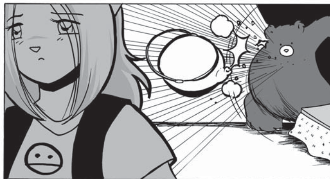
Tea Club